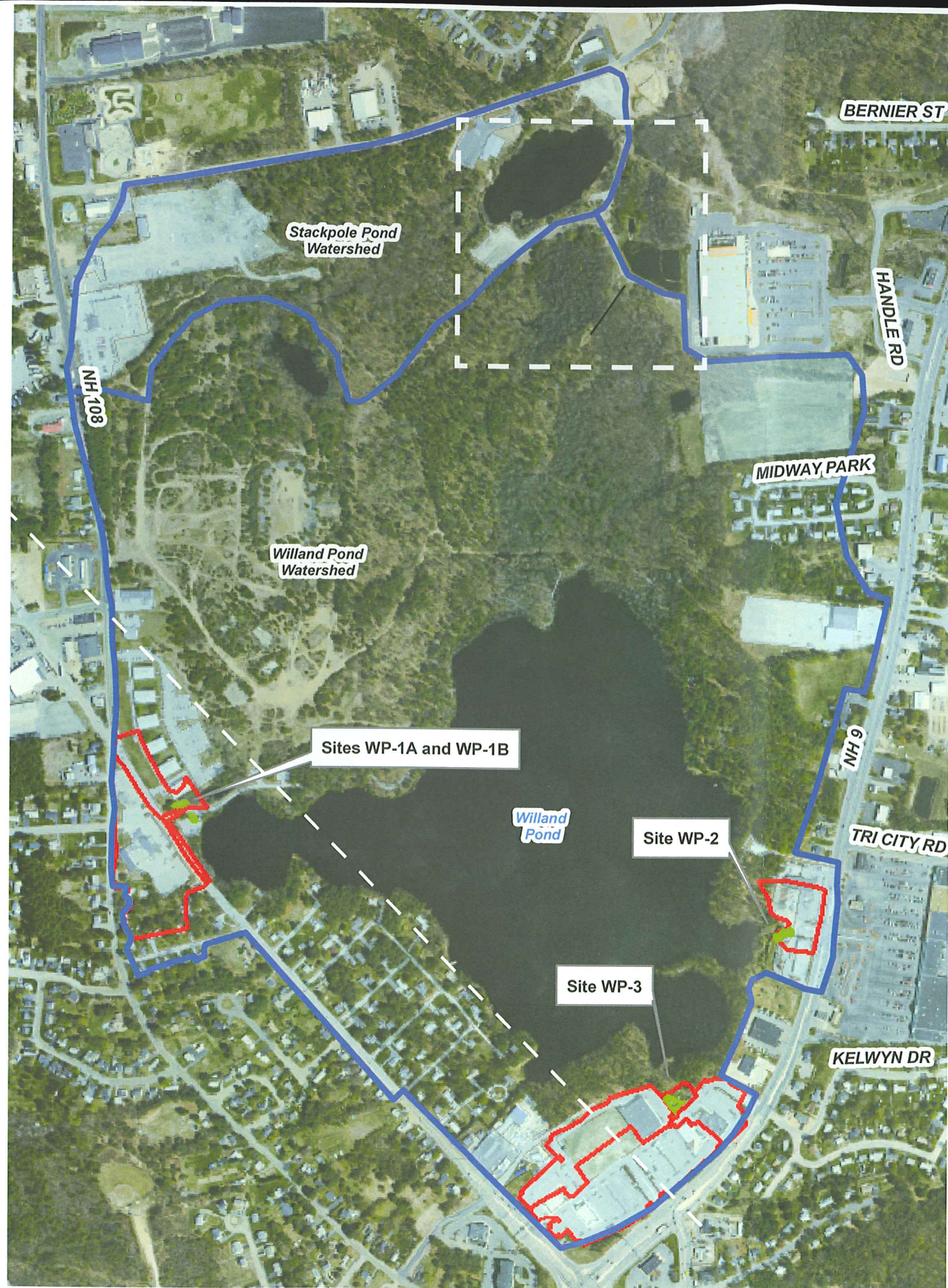
Figure 5.1 Components of Alternative 2 - Hydrologic Connection to Stackpole Pond