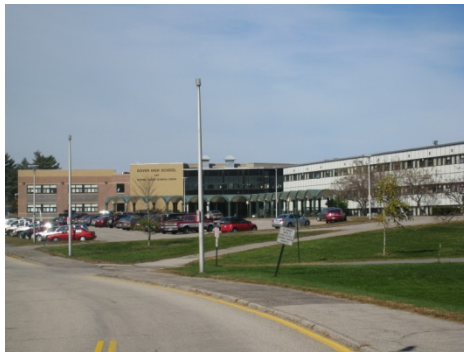
Dover High School and Career Technical Center

December 2, 2009 City Council/Planning Board Workshop Session