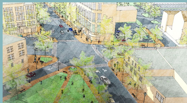
Lower Square will have safer pedestrian crosswalks and two-way traffic flow on Washington Street and Central Avenue.