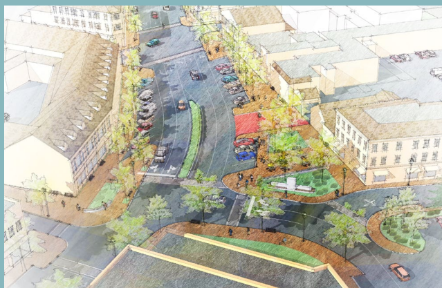
Upper Square will have a new pedestrian plaza on the east side of Main Street / Central Avenue, making for shorter crossing distances.

Central Avenue and Main and Washington Streets are proposed to have two-way traffic flow. Mini-roundabouts will be added at Portland/Main and 3rd/Chestnut to facilitate traffic flow while improving pedestrian crossing conditions.