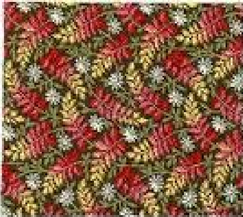
F&B's 'From the Mills' new line, Original print 1881 by Cocheoc. See Reproduction Fabrics link .